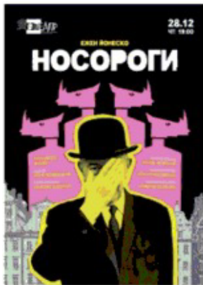
Figure 1 – The color image

In Fig. 3 binary images corresponding to colors with the highest probability of occurrence are presented with indication of their number k , color and probability of occurrence p_k .